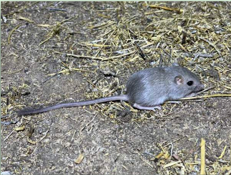
A pocket mouse (genus Chaetodipus , likely penicillatus )

Several other mammals have been observed in the preserve, including bats, packrats, pocket mice, pocket gophers, and cotton rats. However, these are uncommonly seen (except the bats flying around on warm evenings) and even harder to identify. Please refer to the appendix for a more complete species list or take a look at observations on iNaturalist. Some animals, including those pictured below, have been photographed but not yet identified to the species level.