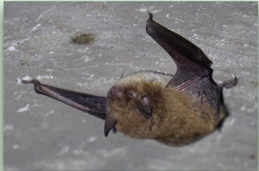
A bat (genus Myotis , possibly volans , occultus , or yumanensis )